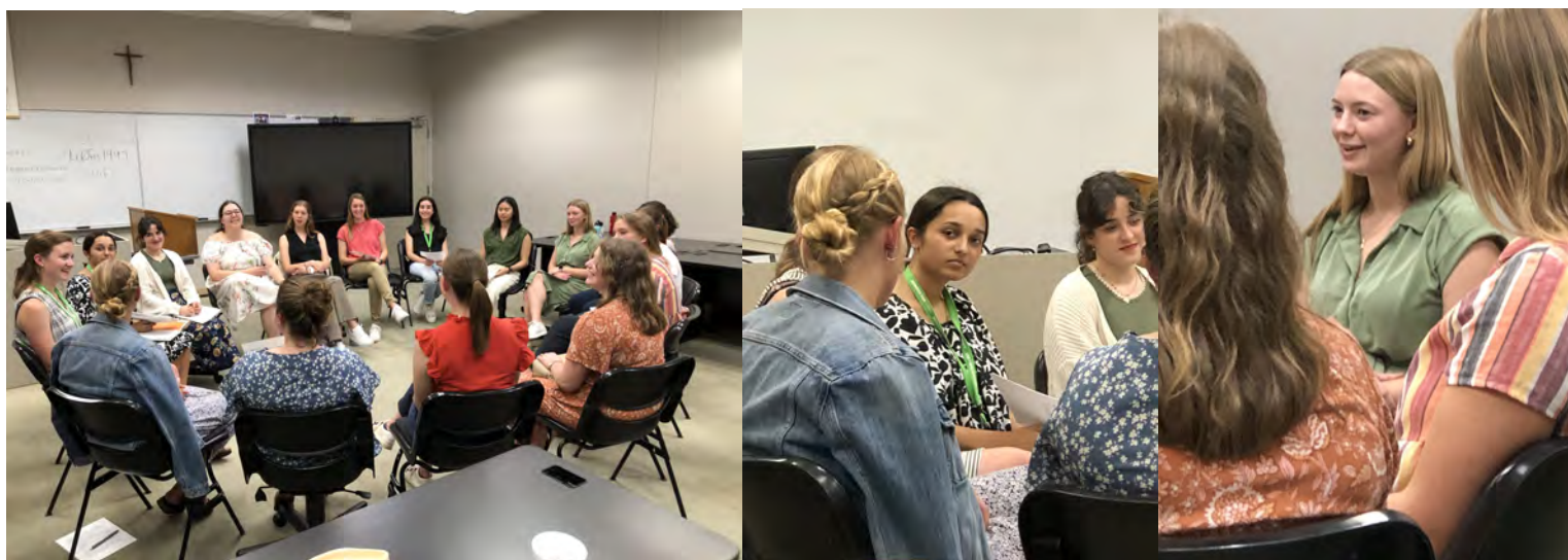
Cycle Mindfulness Leaders Workshop Houston TX, June 2024

Leaders also receive ongoing support in the form of monthly group 1:1 virtual meetings with CMC Team Members, as well as a monthly group gathering with other leaders. Over the course of these group meetings, the leaders hear from guest speakers on a variety of women's health topics, and participate in a book study on a topic related to leadership development. Our hope is that Cycle Mindfulness Club Leaders' impact extends far beyond the time they actively lead a Club, positioning them to connect other women with the truth of their bodies for the rest of their lives.