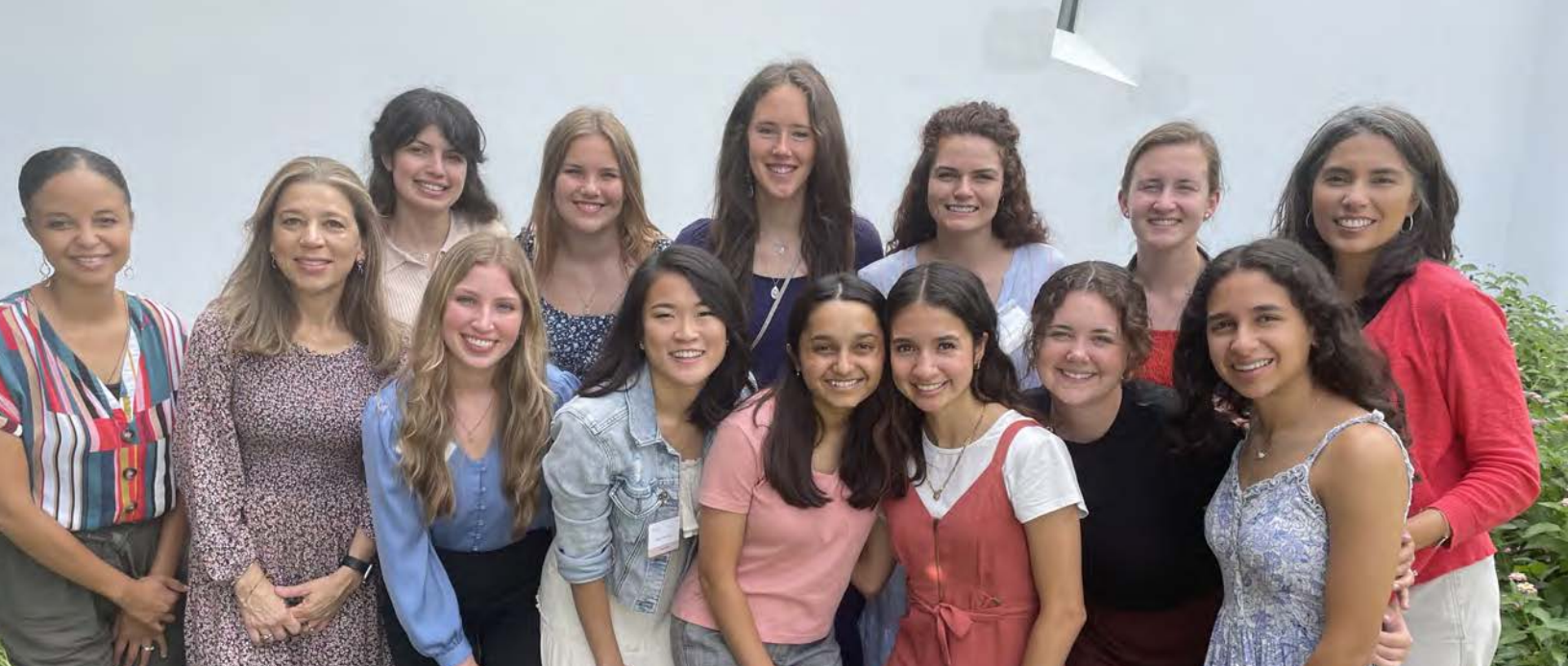
Cycle Mindfulness Leaders Workshop Houston TX, June 2023