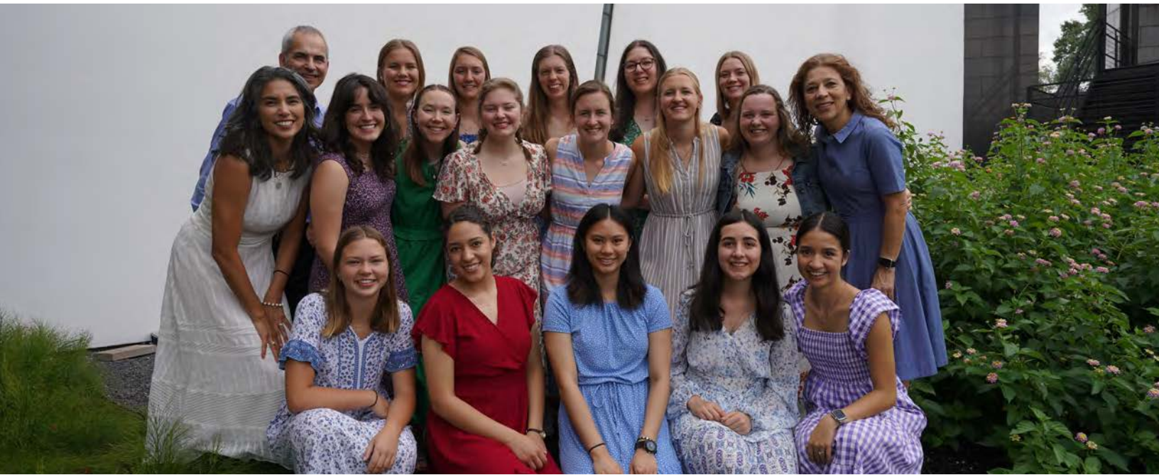
Cycle Mindfulness Leaders Workshop Houston TX, June 2024