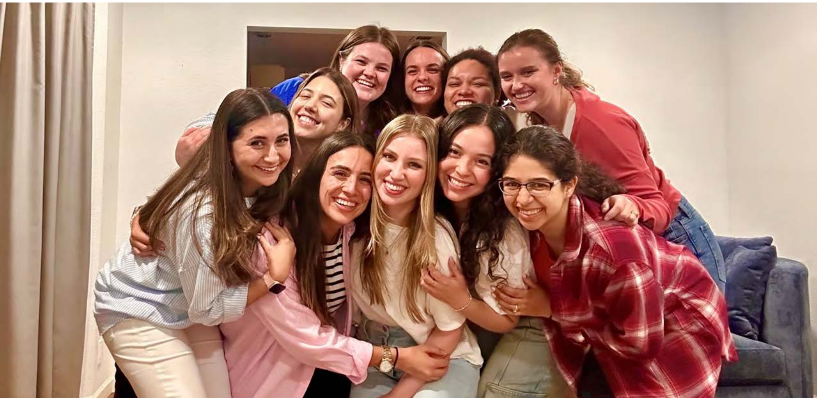
Young Adult Club, San Antonio TX, March 2024

After piloting these Clubs for three academic years, Natural Womanhood has seen that participation leads to something much more profound than can be attained from a simple course or class. Club participants experience something life-changing: a true transformation in the way they see themselves, how they understand themselves as women, and how they choose to care for their bodies.